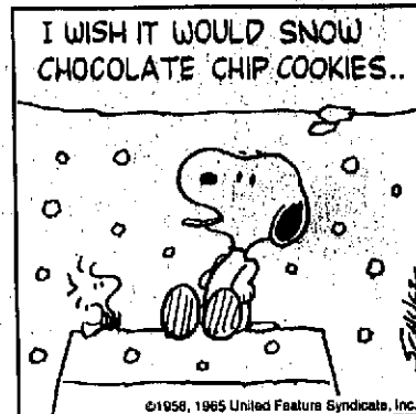
23 Days to Christmas

Everyone is invited to attend the annual event, which will feature Santa and Mrs. Claus, and Christmas music to start the holiday season. Complimentary hot chocolate and coffee will be provided by Hy-Vee. Contest Winner The winner of a contest sponsored by the Constitution-Tribune and the Chillicothe Area Continued on Page 8